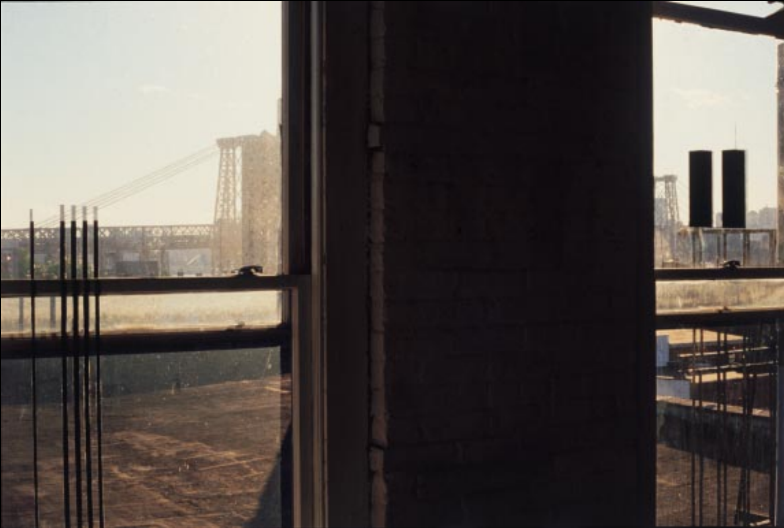
TWINS & SMOKESTACKS (painted silhouettes and view of WTC and Williamsburg Bridge)