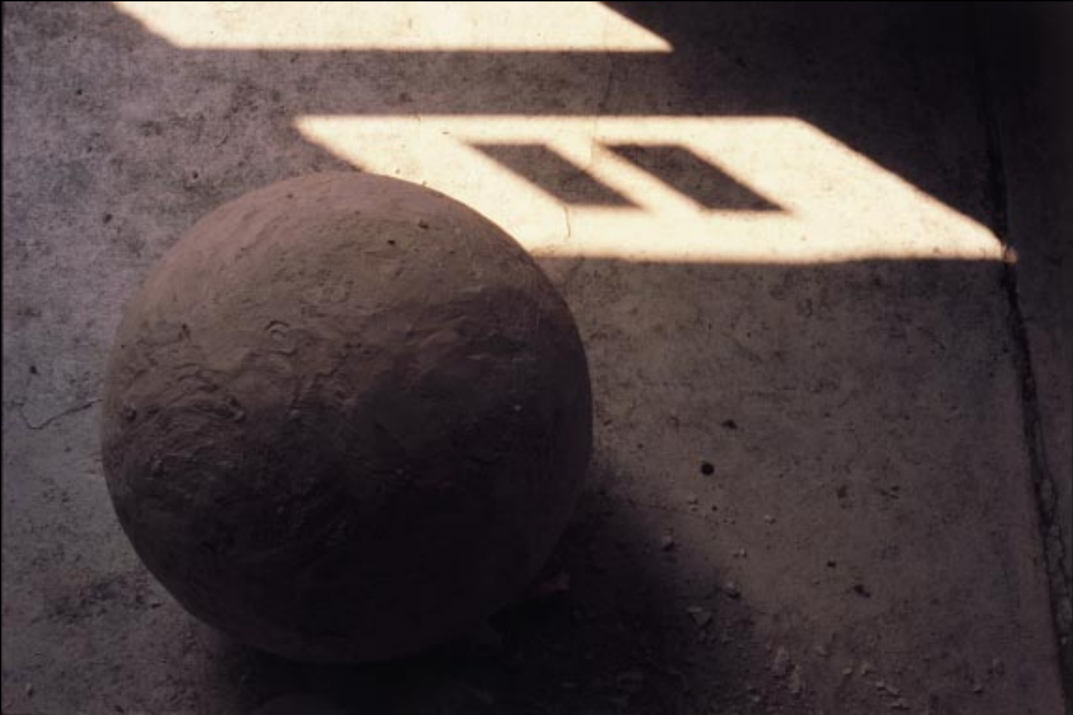
SHADOW AND SPHERE