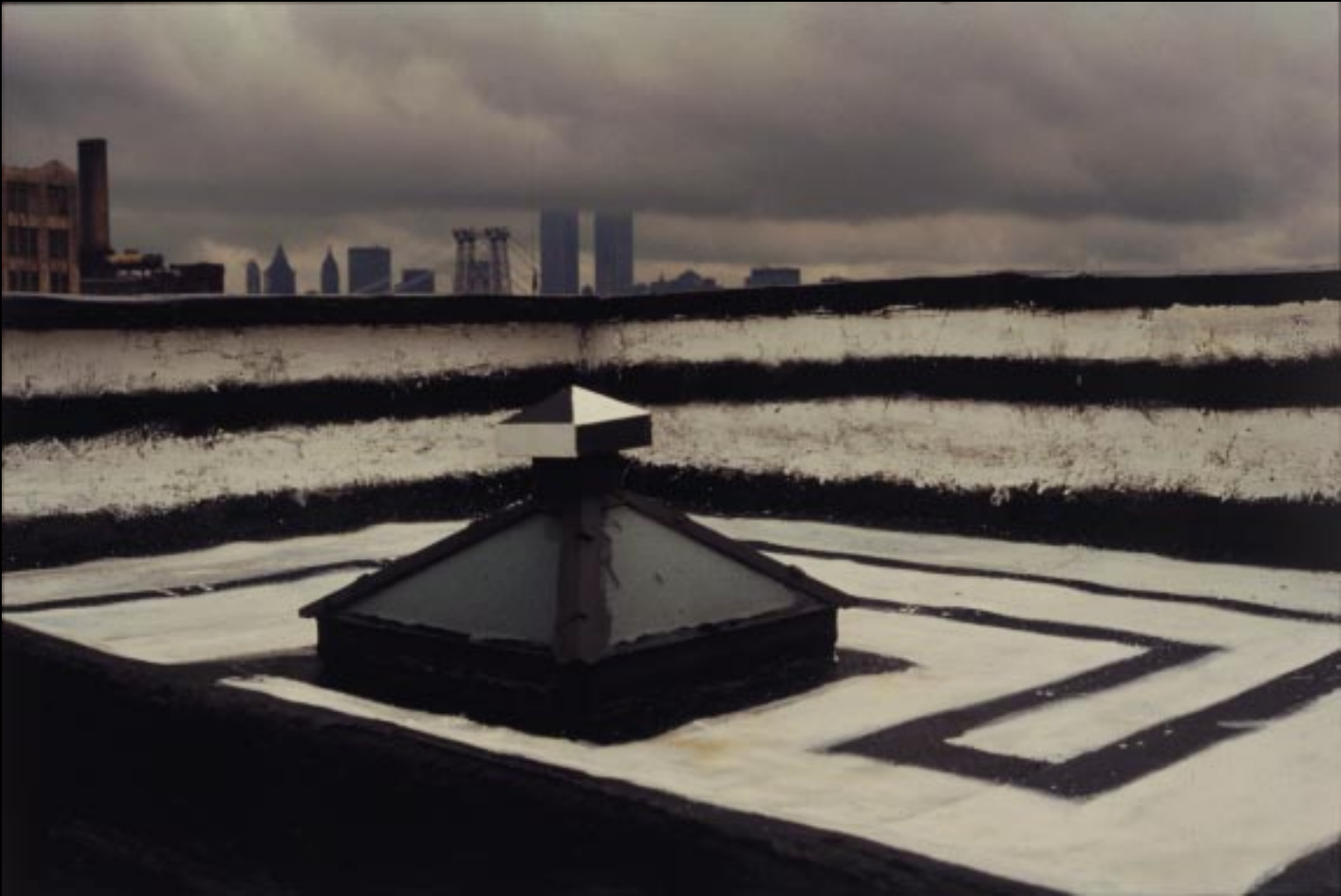
TWINS (painted rooftop and skyline)