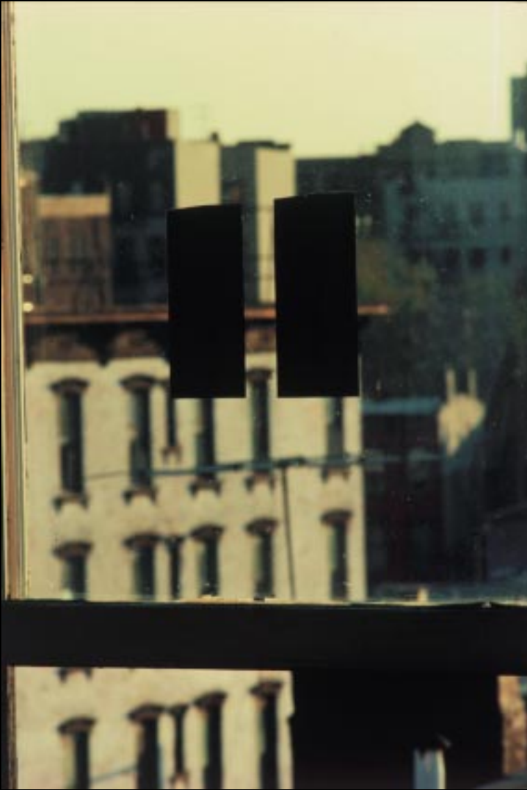
WTC ON BERRY STREET