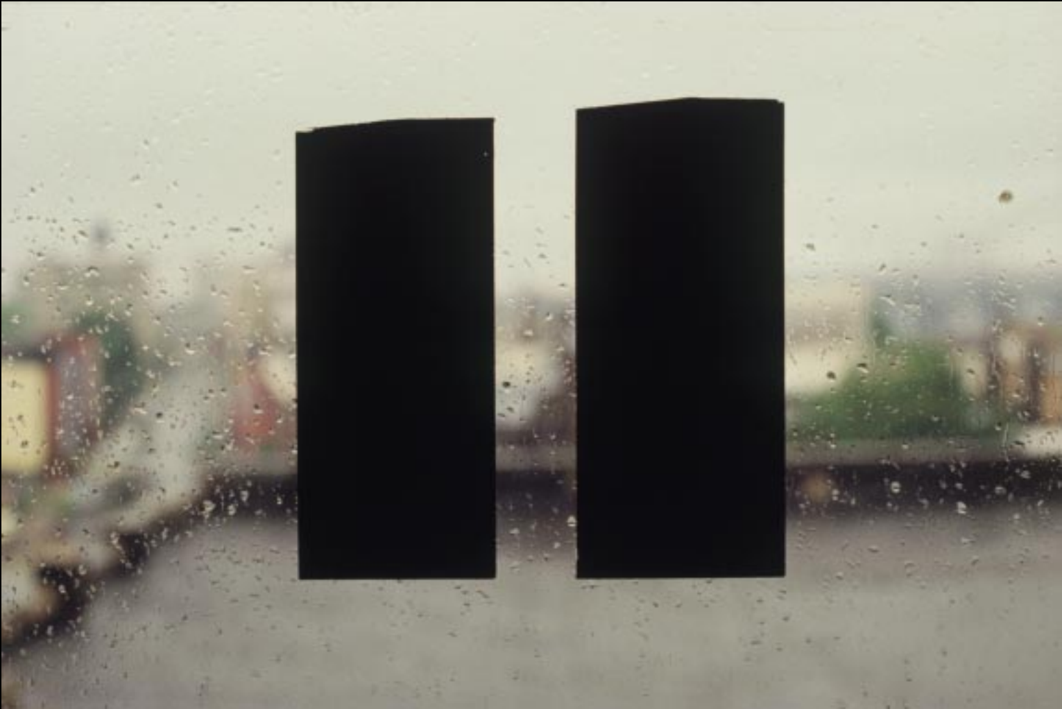
RAINDROPS (painted silhouette of WTC)