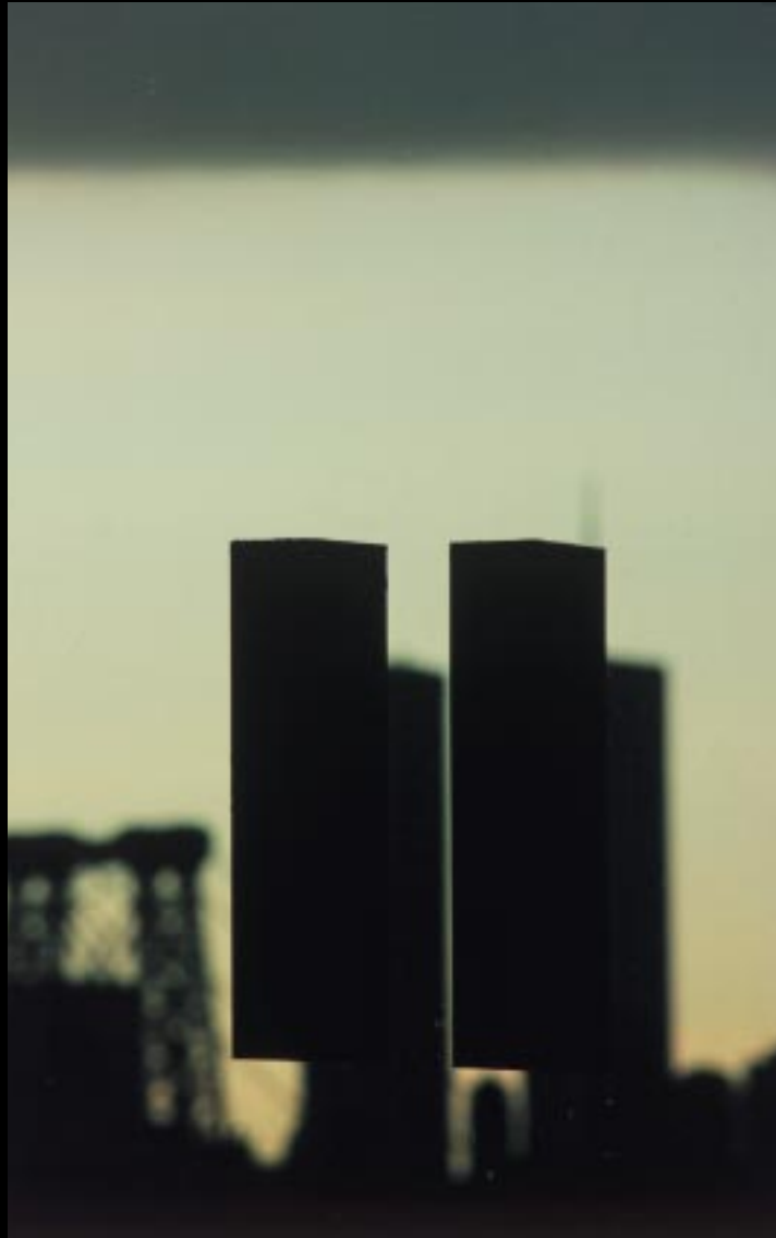
TWINS (EVENING) (painted silhouette on window and view of WTC)