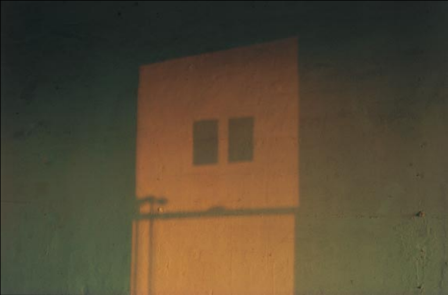
SHADOW OF WINTER SOLSTICE