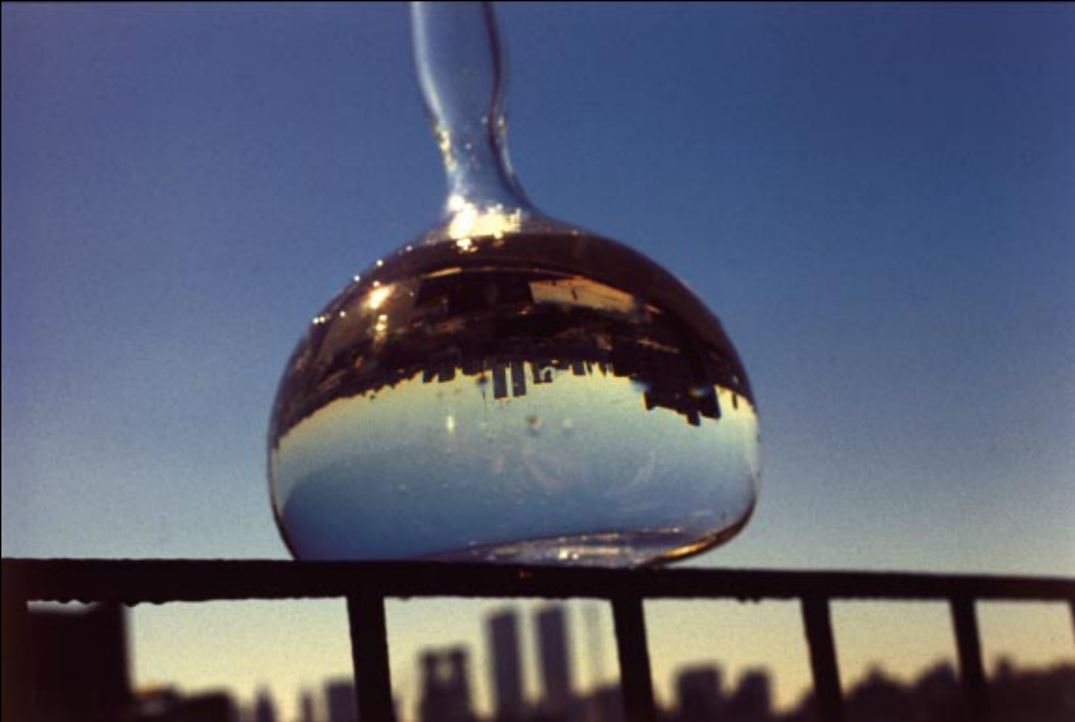
THROUGH THE WATER- GLASS