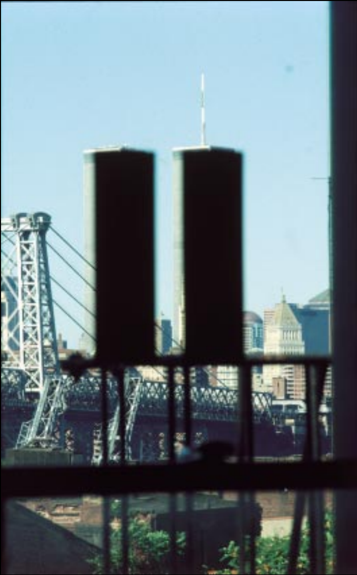
WTC & SILHOUETTE