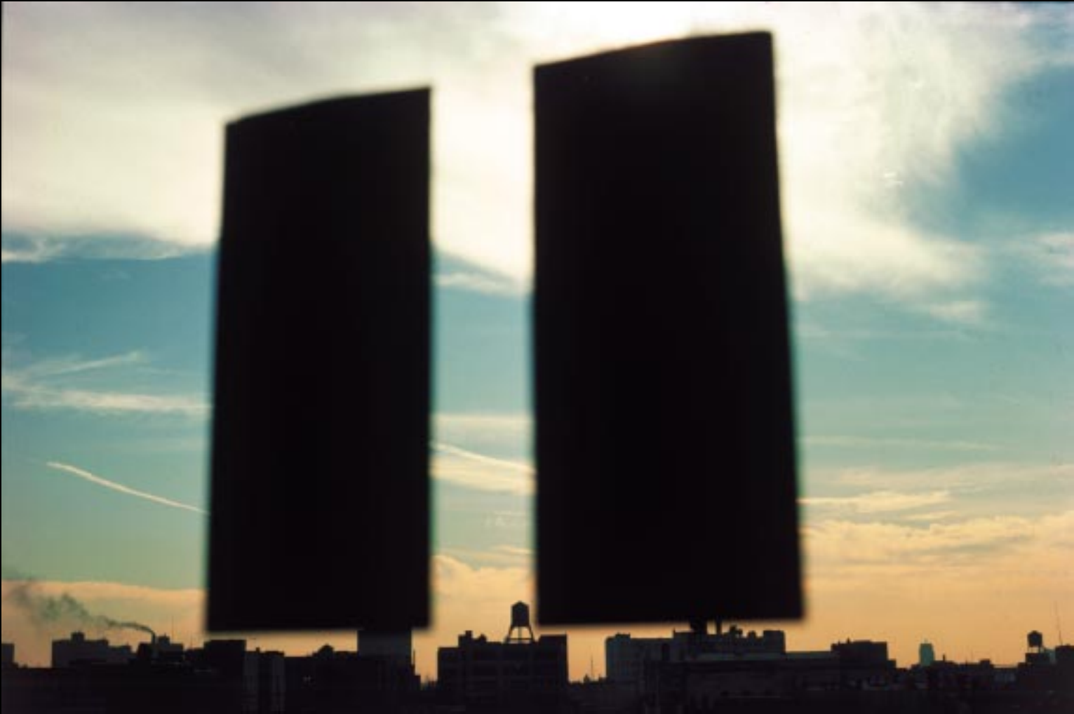
BROOKLYN SKYLINE 1